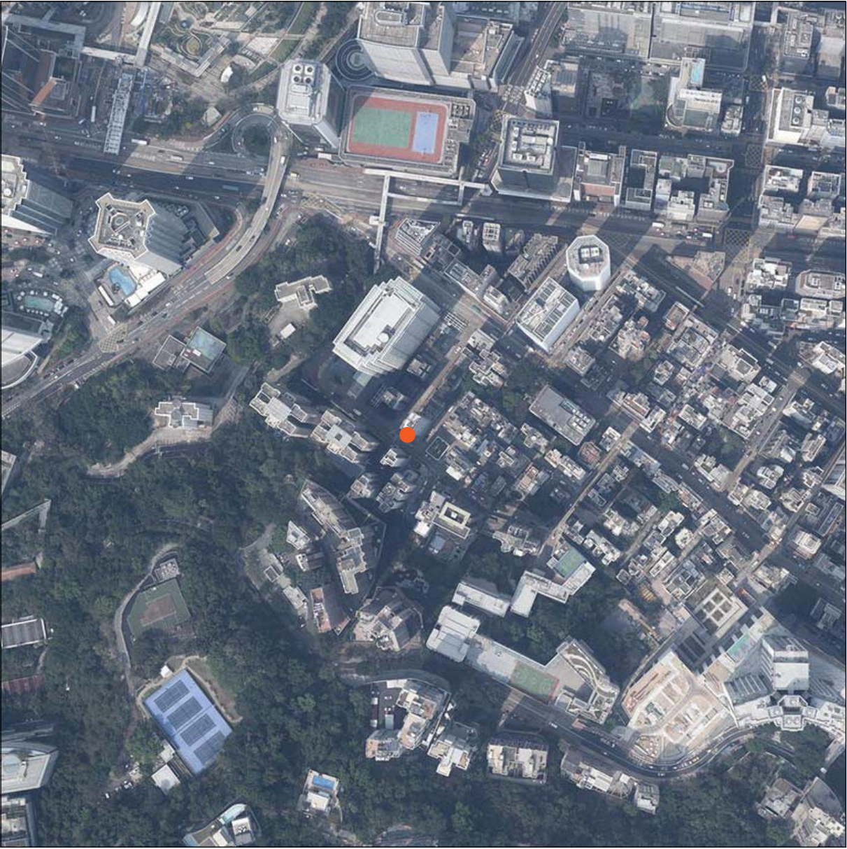
● EIGHT STAR STREET